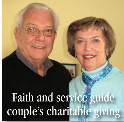
Faith and service guide couple's charitable giving