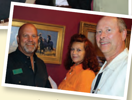
Guests enjoy the Ward Museum of Wildfowl Art’s Exhibition of Gallery of Artists’ opening night reception.

Entitled “Artistic Perspectives on Nature”, this three day exhibit featured award-winning wildlife artists talented in all mediums and styles. A portion of the proceeds benefited programs at the Ward Museum and supported the CFES Fund for the Environment.