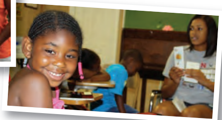
A student participates in class at the Fruitland Community Center.