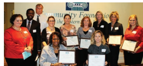
Six Somerset County Schools received 2011 Education Award Grants.

Please visit www.cfes.org for a complete listing of the schools and their award-winning programs.