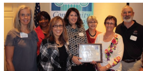
The Wicomico County TAD Program received the 2011 Mary Gay Calcott Award of Excellence for the most creative education program submitted this year for the Foundation's Education Awards Grant Program.