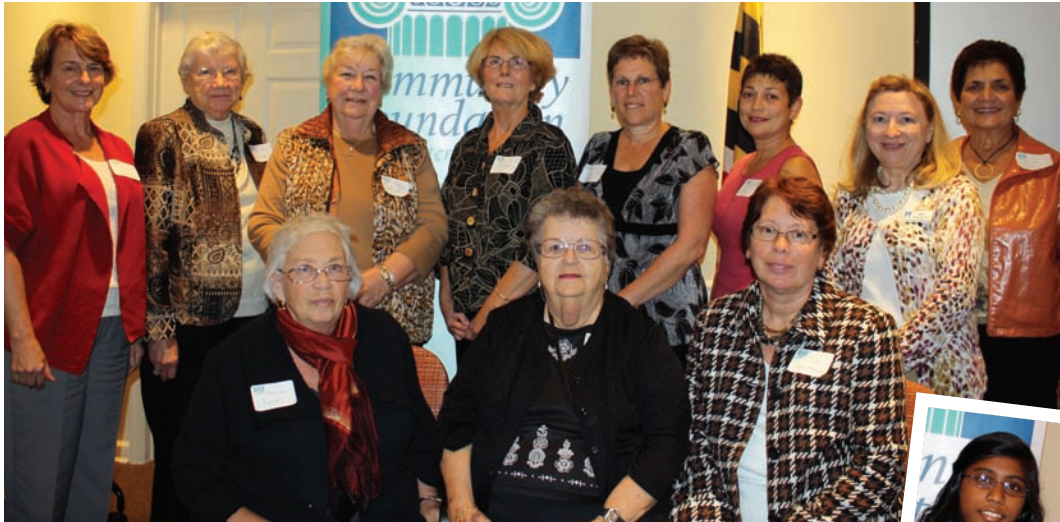
(Left) Coastal Hospice Volunteers receive the Nonprofit Award at the Summer Stars Awards program.

Please visit www.shorecan.org for more information. Let us help you make a difference in your community!