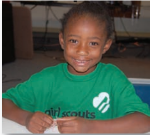
Grant funds have been awarded to a new Girl Scout Outreach Troop, which will be located at First Baptist Church.