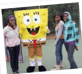
Wicomico County Tourism's Pork in the Park event

ShoreCAN manages a database of over 350 volunteers and over 100 local nonprofits with a wide range of service opportunities for all ages. Visit www.shorecan.org for more information.