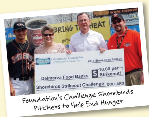
Foundation's Challenge Shorebirds Pitchers to Help End Hunger