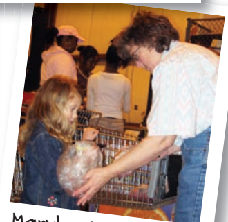
Maryland Food Bank