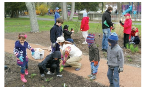
Town of Berlin clean up day