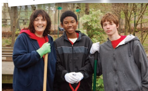
Boy Scout Troop #478 Salisbury Zoo